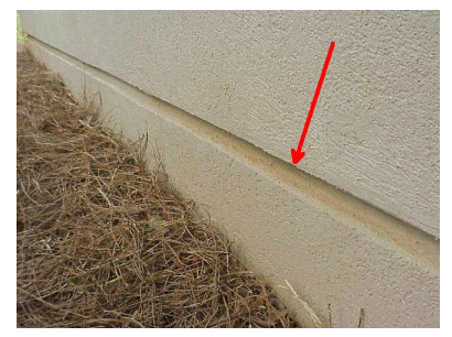
Good termite band