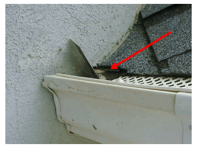
Gap in flashing overlap - high readings / poss damage below