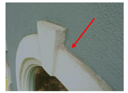
Accent well sealed