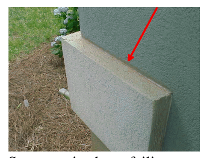
Some quoins have failing sealants - touch up all as