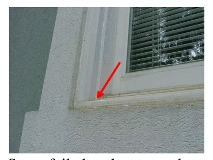
Some failed sealants noted at miters - touch up all as