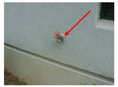
Seal all utility breaches